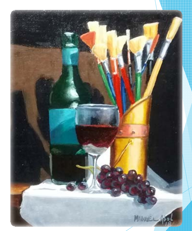
Manuel Abad, Title unavailable Oil on canvas, 2018