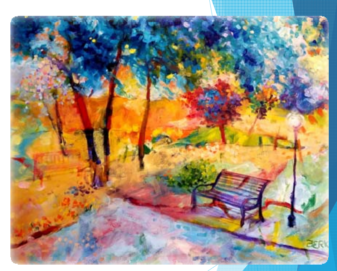
Betty Berk, Perspectives In The Park . Oil on canvas, 24 x 30 in. 2018